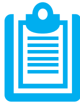
Past History of STDs